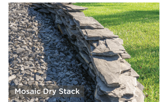
Mosaic Dry Stack