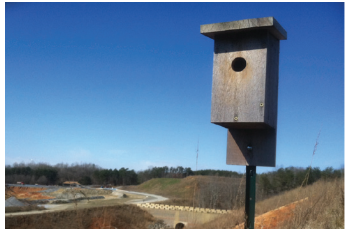
Above: VA DMME cites Lawyers Road Stream Channel Change as model for industry.