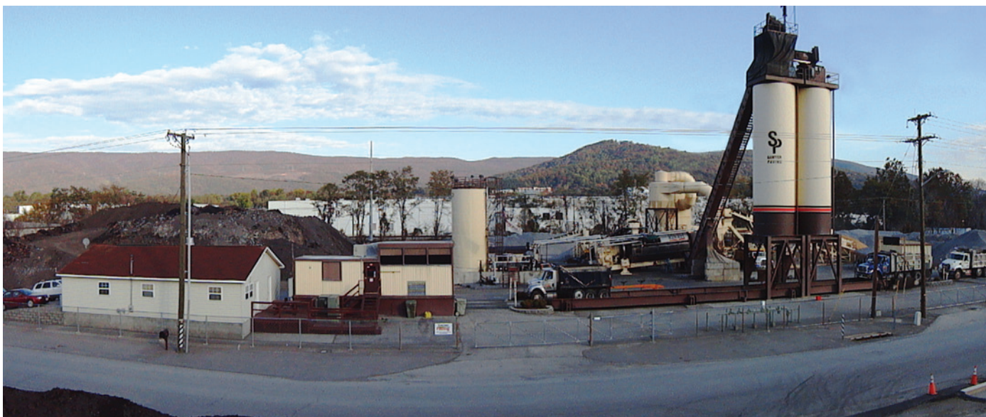
Above: Sawyer Paving earned the prestigious Diamond Achievement Commendation for Excellence.