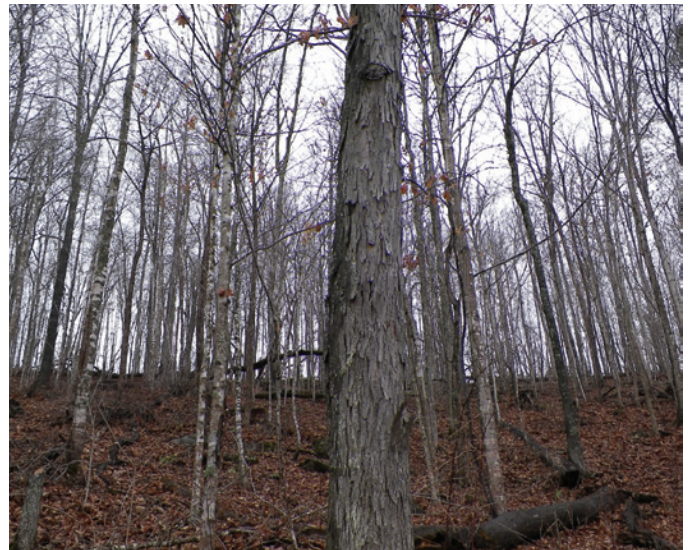
Above: Shagbark Hickory trees are a potential habitat for bats.